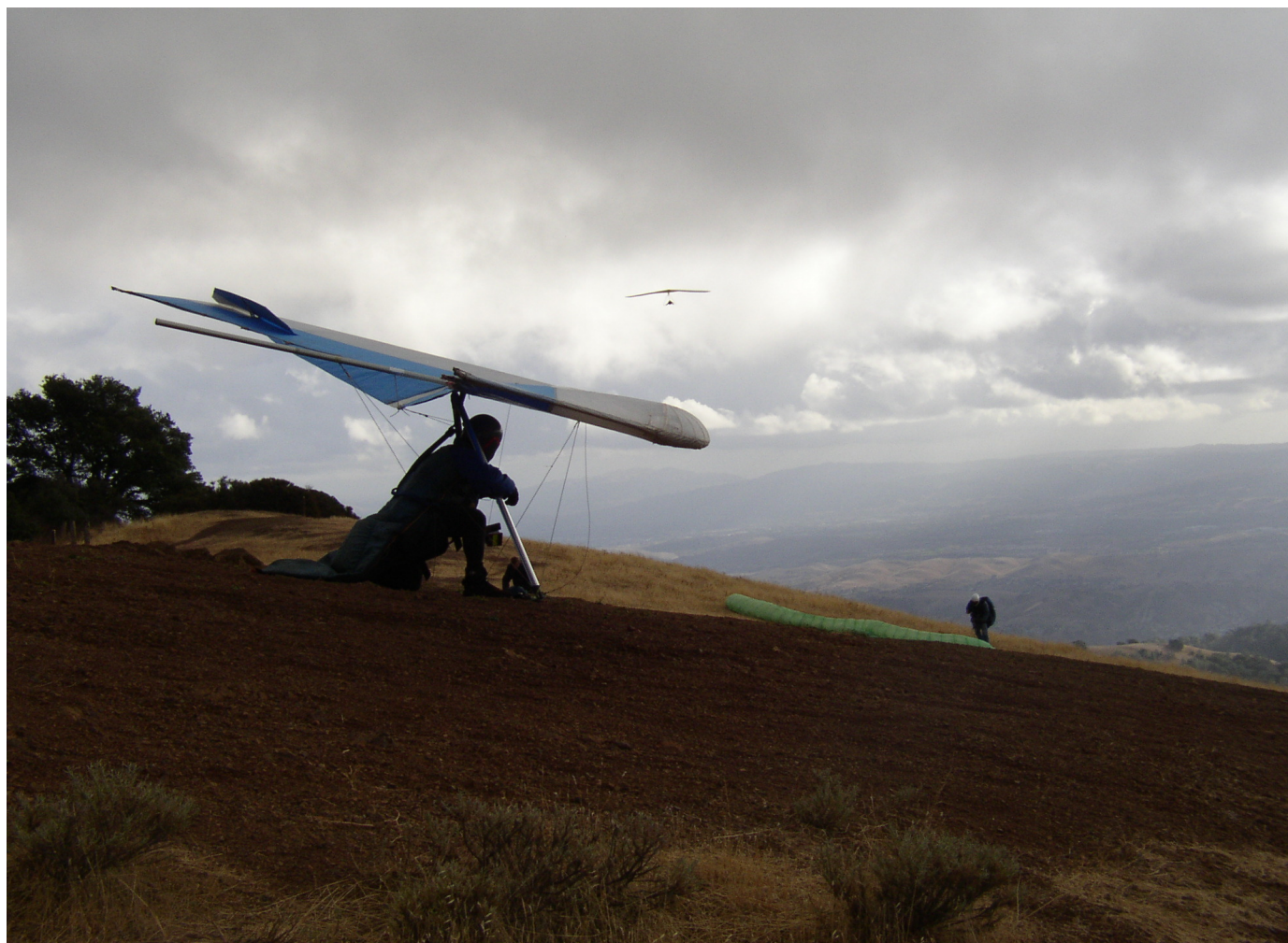
Photo : ERLCP on an occasionally soarable day

The publication of the Wings Of Rogallo Northern California Hang Gliding Association Volume-133, Number 2 Apr 2014