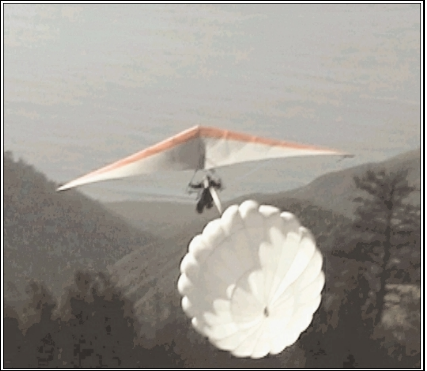
Another Microsoft Moment!

THE PUBLICATION OF THE WINGS OF ROGALLO NORTHERN CALIFORNIA HANG GLIDER ASSOCIATION VOLUME 102, NUMBER 2 FEBRUARY 2002