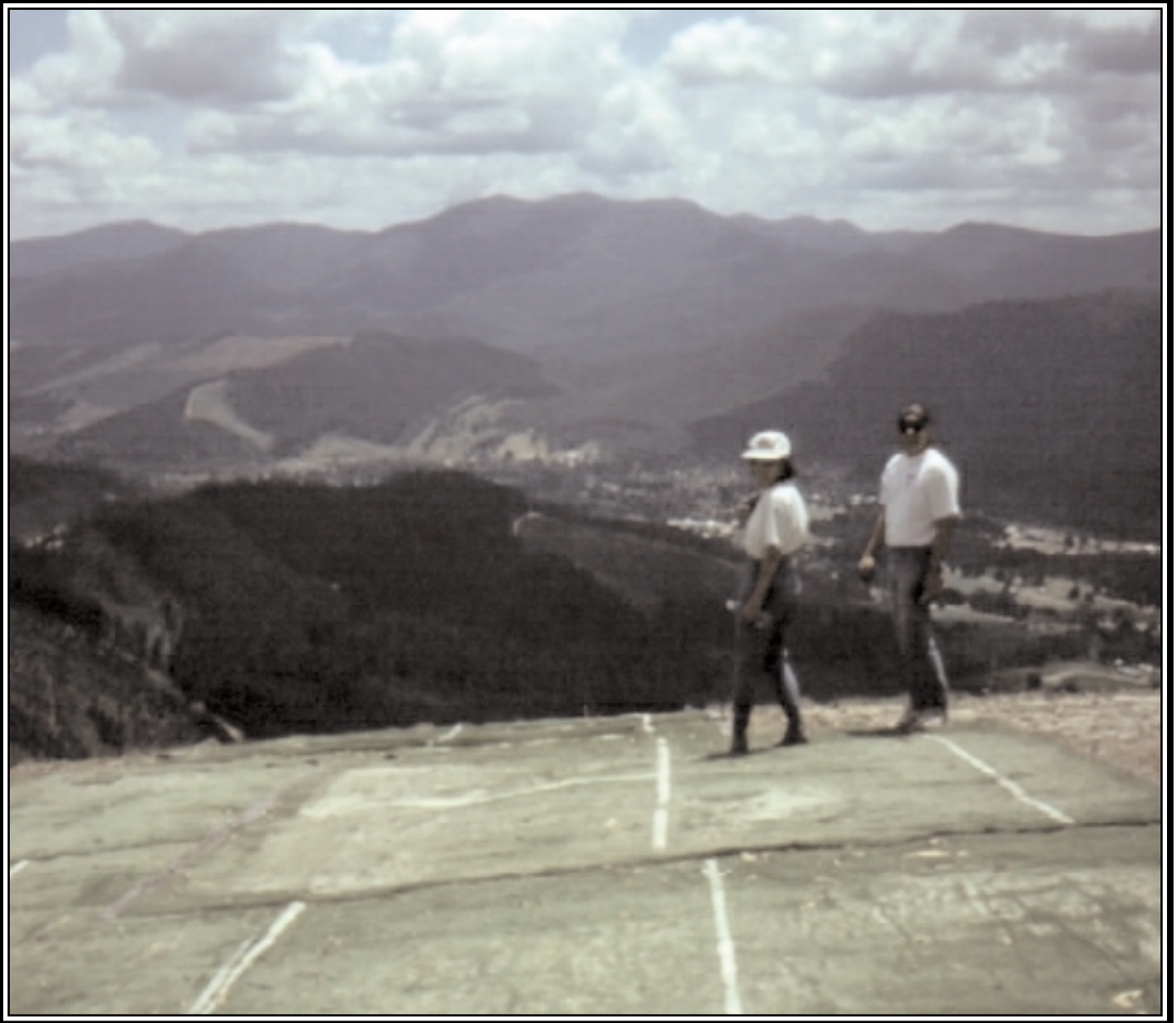
Bright Launch, Australia -- the Place Where Old Tennis Courts go to Die...

THE PUBLICATION OF THE WINGS OF ROGALLO NORTHERN CALIFORNIA HANG GLIDER ASSOCIATION VOLUME 103, NUMBER 2 FEBRUARY 2003