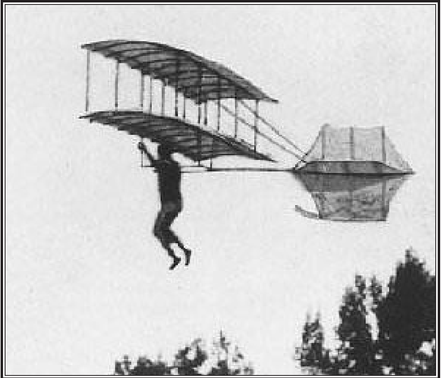
Chanute Wings announces the control frame version of the Century hybrid wing for 1900

THE PUBLICATION OF THE WINGS OF ROGALLO NORTHERN CALIFORNIA HANG GLIDER ASSOCIATION VOLUME 00, NUMBER 01, JANUARY 1900