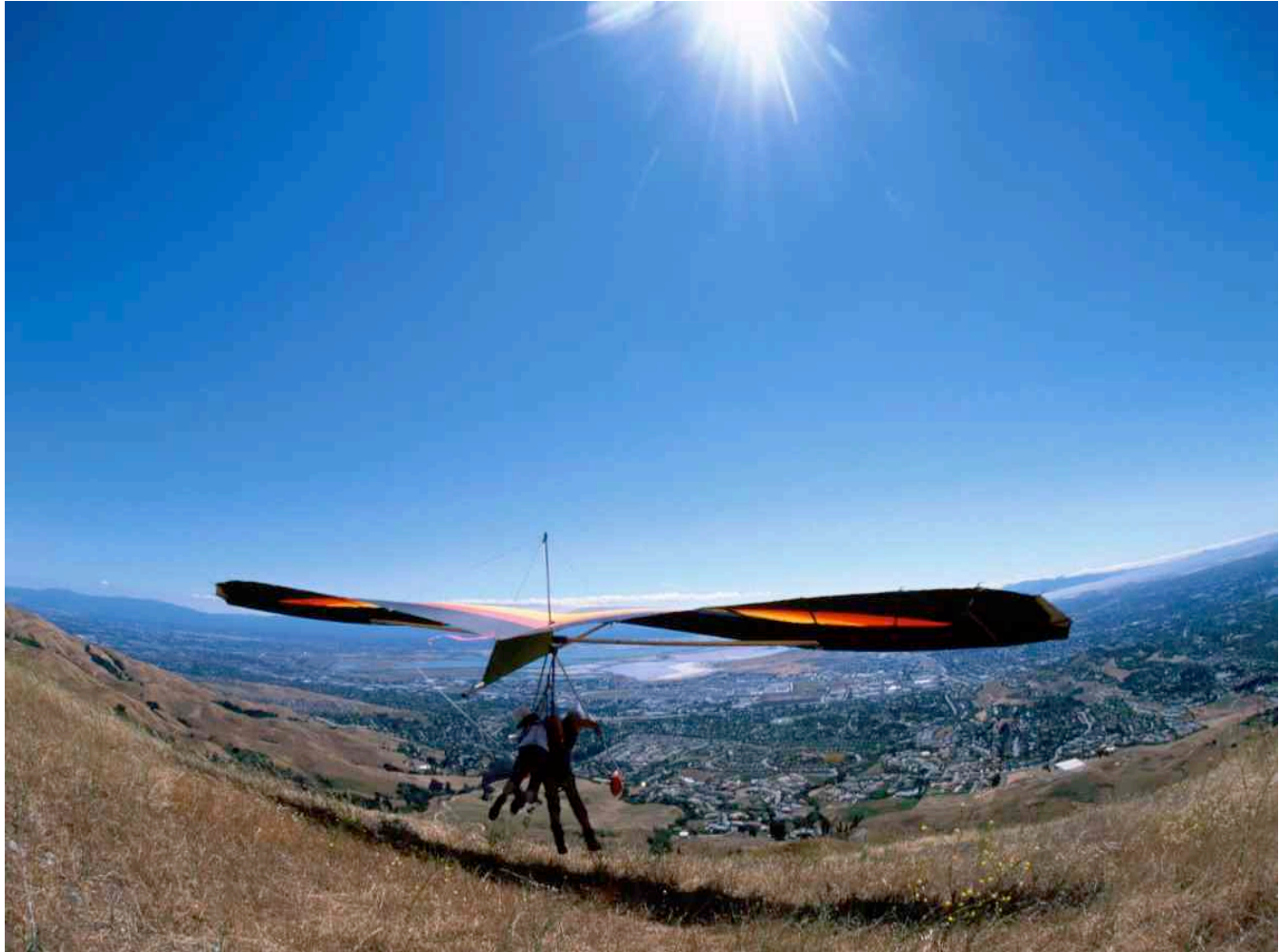
A GoodLookingRichGuy doing a tandem launch @ Mission

The publication of the Wings Of Rogallo Northern California Hang Gliding Association Volume-126,Number 1 January 2008