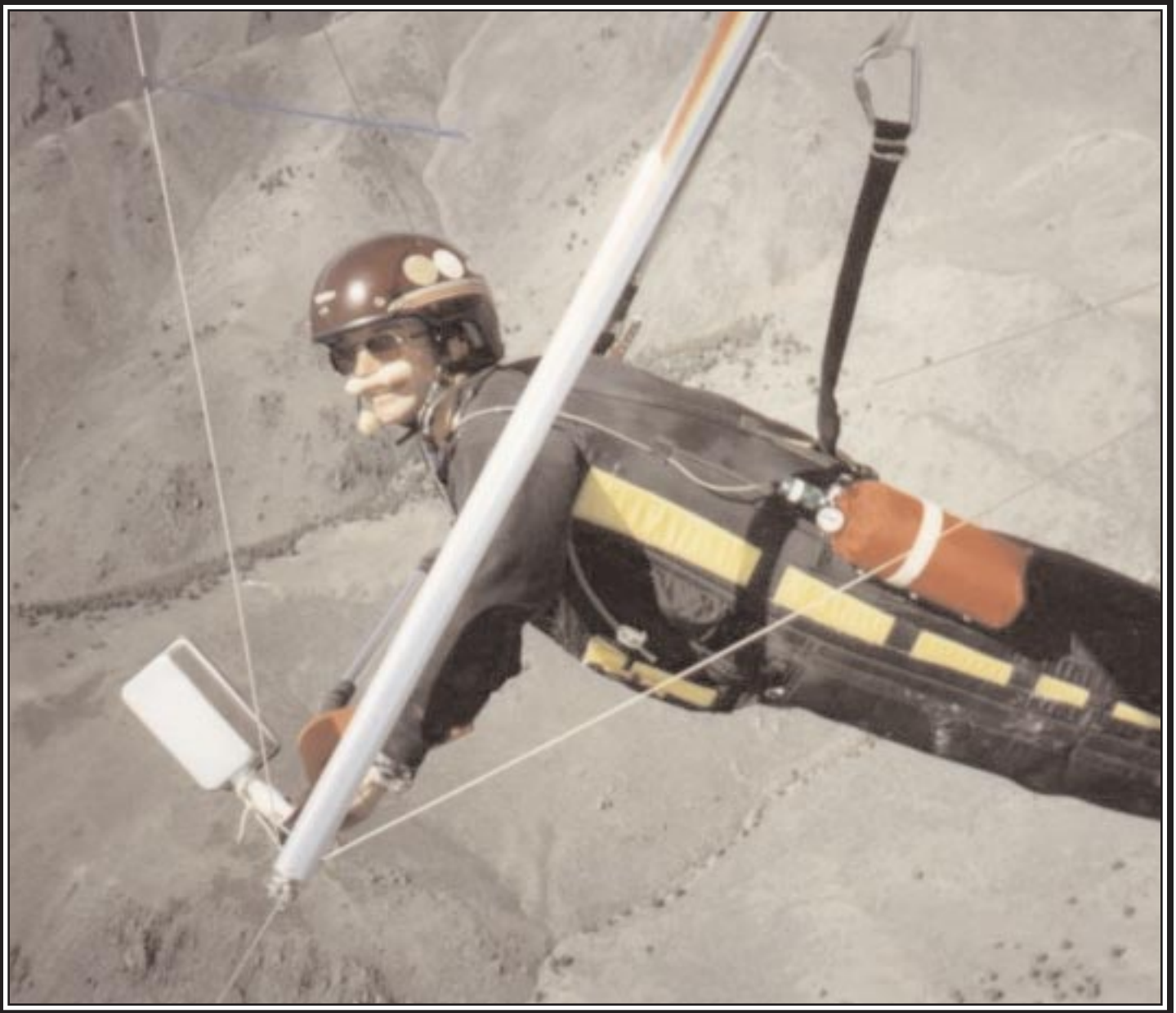
Fun in the Owens. But is this man flying with Oxygen or Nitrous?

THE PUBLICATION OF THE WINGS OF ROGALLO NORTHERN CALIFORNIA HANG GLIDER ASSOCIATION VOLUME 100, NUMBER 06, JUNE 2000