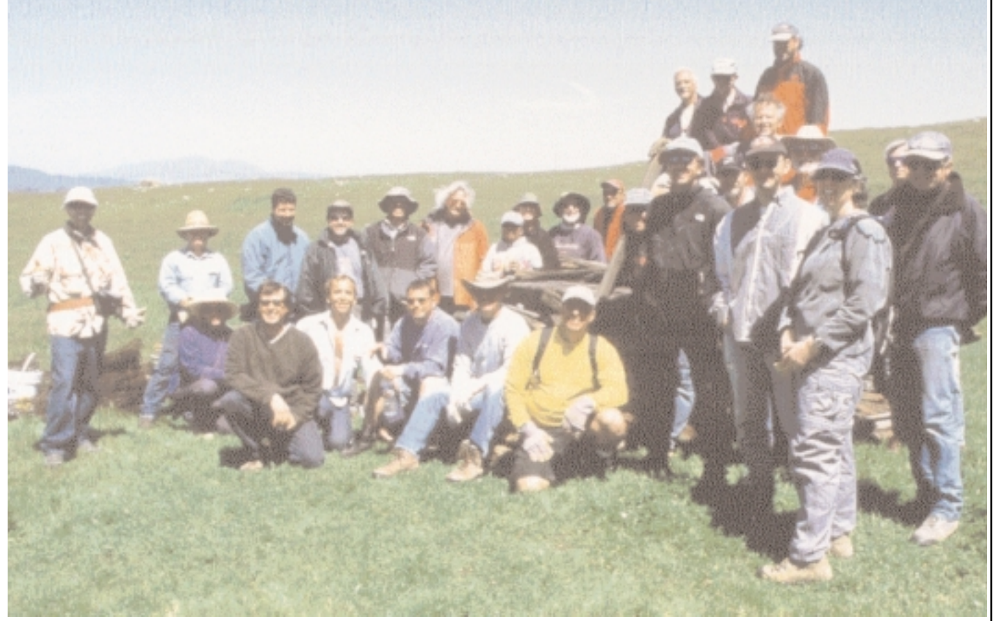
Mission Ridge Groundskeepers: Fences Removed While You Wait!