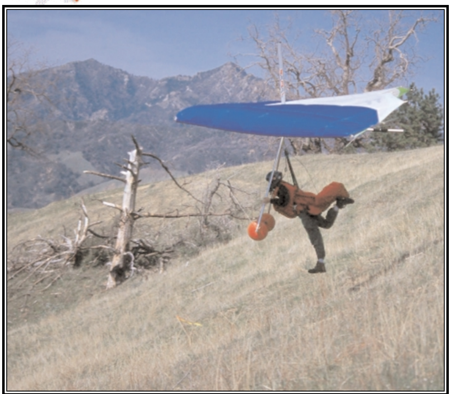
Novim launching Big Sur

The Publication of the W ings of Rogallo Northern California Hang G Liding Association volume -103, number 6 June 2003