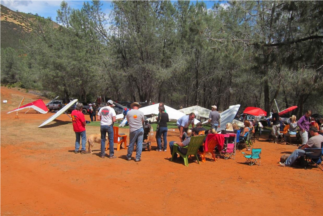
Coyote Howl 2016

The publication of the Wings Of Rogallo Northern California Hang Gliding Association Volume 135, Number 3 May/June 2016