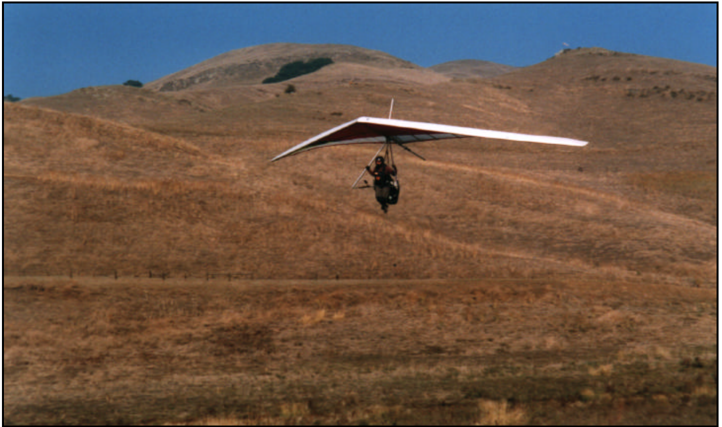
Pilot: Unknown, Place, Ed Levin Park, Milpitas, Ca.

THE PUBLICATION OF THE WINGS OF ROGALLO NORTHERN CALIFORNIA HANG GLIDER ASSOCIATION VOLUME 99, NUMBER 3, MARCH 16TH, 1999