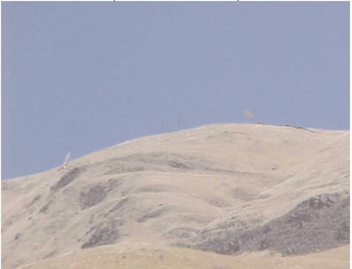
Ed Levin may also offer some unique launch opportunities. Don't take advantage of them...

Hiking, horseback riding, boating, exploring local history, and of course, flying - good ol' Ed has a lot to offer!