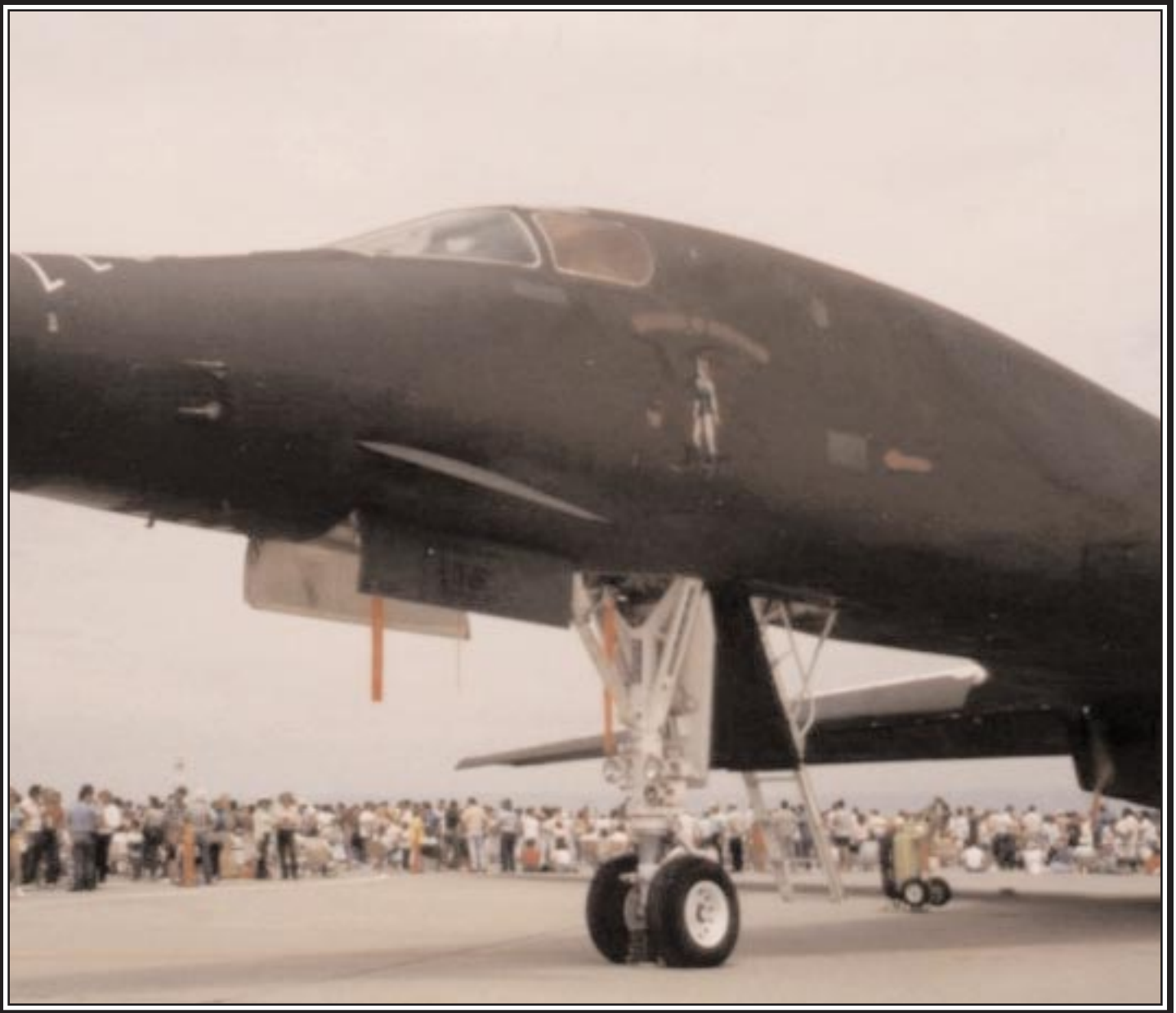
W O R pilots examine the Rotary Missile Launcher on the new Ghostbuster

THE PUBLICATION OF THE WINGS OF ROGALLO NORTHERN CALIFORNIA HANG GLIDER ASSOCIATION VOLUME 99, NUMBER 11, NOVEMBER 1999