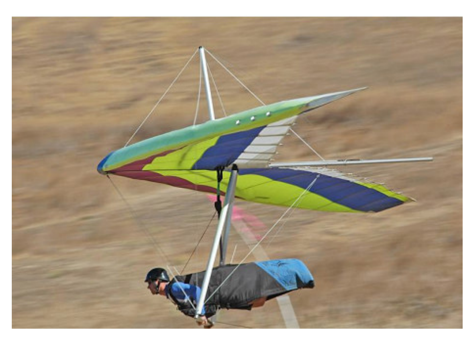
Cover photo: Day 1 of Speed Gliding Competition

Sailplanes Candy Drop Aerobatics Frisbee Catch RC Demos