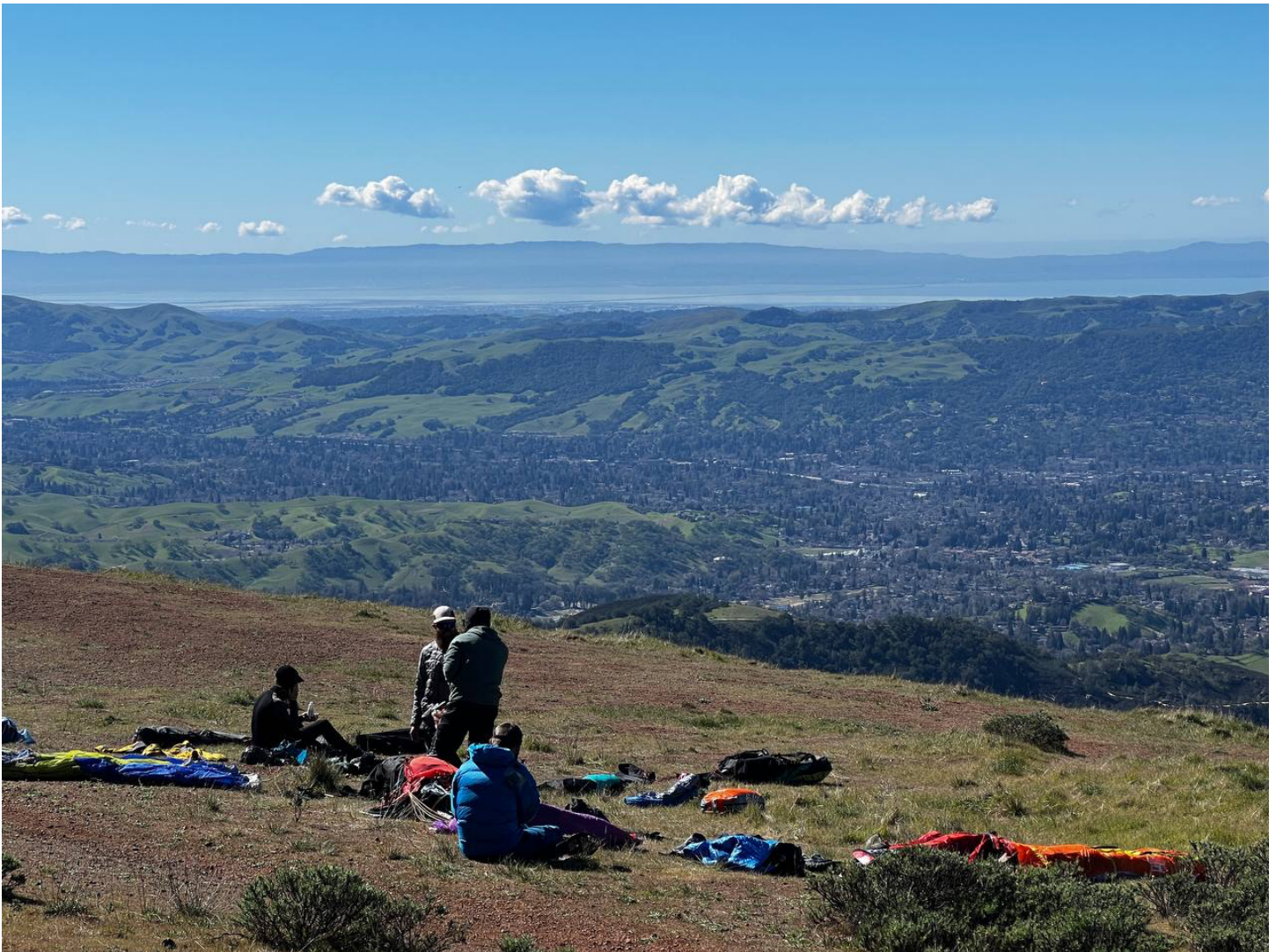
Enes Mentese captures a charming moment of pilots syncing plans on the big Diablo Day

“One of the coolest things about that day was seeing the different routes taken and meeting up with seemingly long-lost friends throughout the flight. Some pilots followed the higher terrain South East toward the Altamont and made a clockwise path around Livermore. A few others decided to head South West, either heading toward Mission or working on the counter-clockwise triangle.”